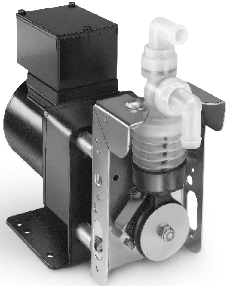
1½" HEAVY-DUTY MODEL

The heavy-duty models are specially designed for use in dusty environments or for those applications requiring extremely long life. The pump is supplied with a totally enclosed gearmotor with an expected life of over 10,000 hours. The standard crank mechanism is used on heavy-duty pumps. The heavy-duty pump is recommended for 24 hour/day continuous duty applications.